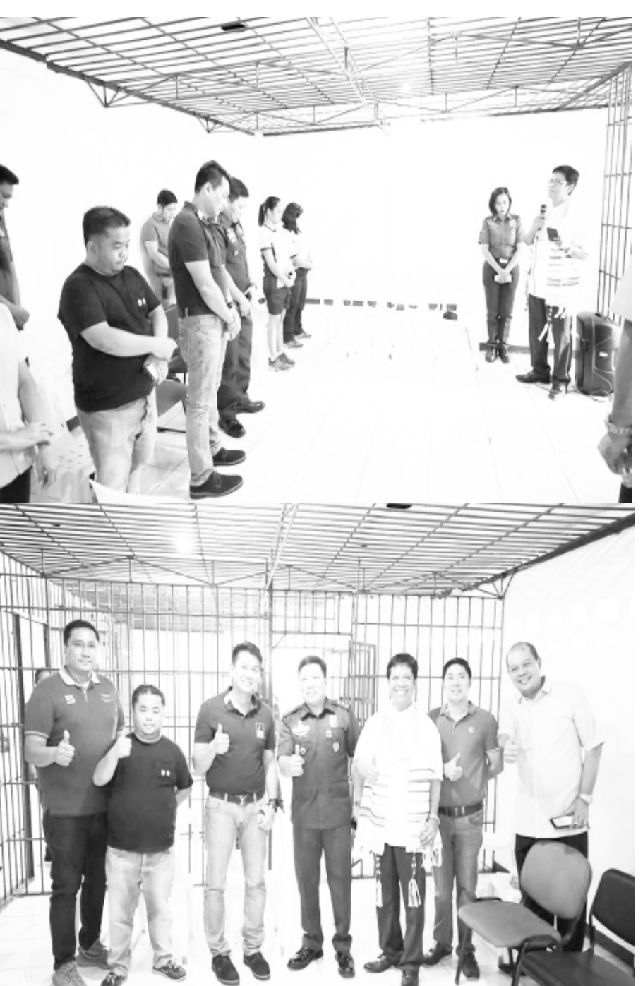
#ImusPNP #NewImusCityJail #MayorELM #EpektibongLingkodMamamayan #Imus #Cavite #CityOfImus #FlagCapital #CityGovernmentOfImus

Blessing of our new Imus City Jail held on May 16, 2019 at Imus City Police Station